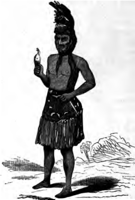
MEDICINE MAN, BARCLAY SOUND.

patient, and after a mystic incantation would administer a medicine in the shape of a draught out of a bottle made of wood, and which resembled a bird, the medicine appearing like the juice of the water-